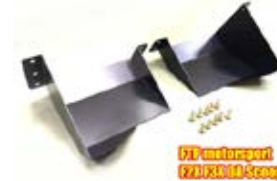
Dynamic Air scoop