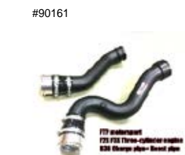
B38 Charge pipe+ Boost pipe