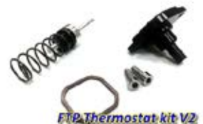
Thermostat kit V2