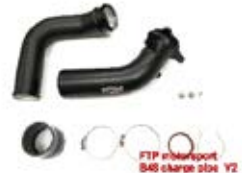
B48 charge pipe 2