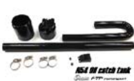
N54 Oil catch tank