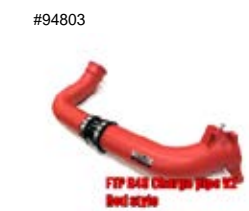
B48 charge pipe RED