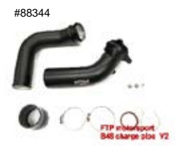
B48 charge pipe 2