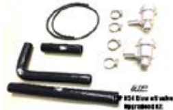
N54 Recirculation Valves blow off vavle kit