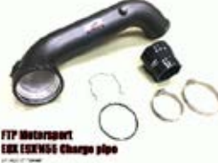
N55 charge pipe