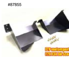
Dynamic Air scoop