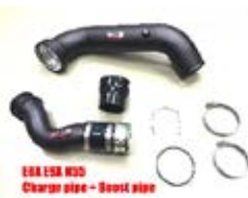
N55 Charge pipe+Boost pipe