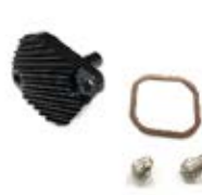
Thermostat cover kit