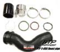
N55 Boost pipe