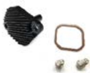
Thermostat cover kit