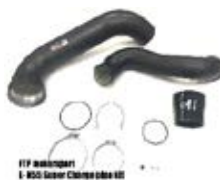
N55 Super Charge pipe kit