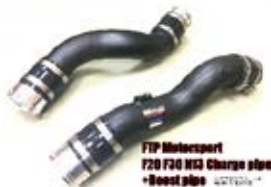
N13 charge pipe + Boost pipe