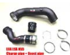
N55 Charge pipe+Boost pipe