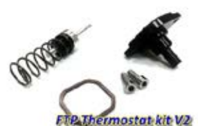
Thermostat kit V2