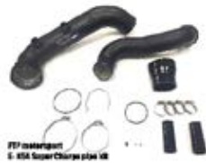
N54 Charge pipe Kit