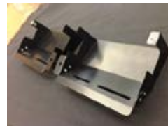
Dynamic Air Scoops