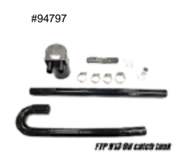
N13 oil catch tank kit