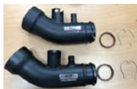
B48 Replace small intake pipe