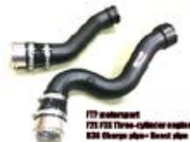
B38 Charge pipe+ Boost pipe