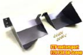
Dynamic Air scoop