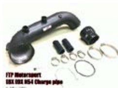
N54 charge pipe