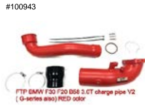
B58 charge pipe V2 RED