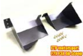
Dynamic Air scoop