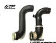
N55 air induction pipe