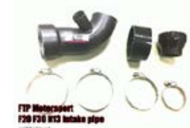
N13 intake pipe