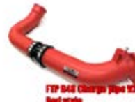
B48 charge pipe RED