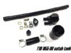
N55 oil catch tank