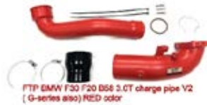
B58 charge pipe V2 RED