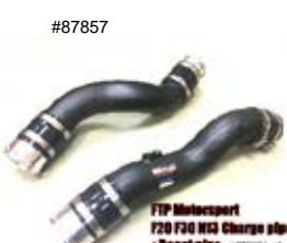
N13 charge pipe + Boost pipe