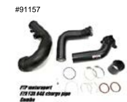
B48 charge pipe+ intake pipe