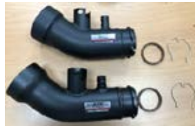
B48 Replace small intake pipe