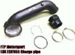
N55 charge pipe