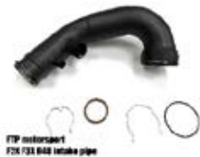
B48 intake pipe