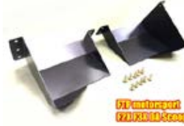
Dynamic Air scoop