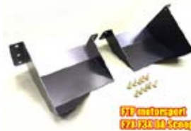
Dynamic Air scoop