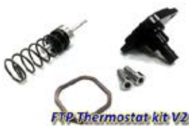
Thermostat kit V2