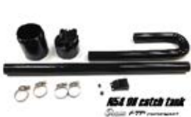
N54 Oil catch tank