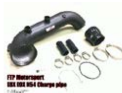
N54 charge pipe