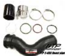
N55 Boost pipe