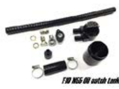
N55 oil catch tank