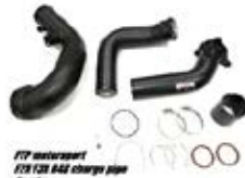
B48 charge pipe+ intake pipe