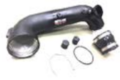
N54 Tial BOV Charge pipe