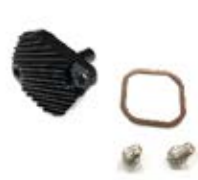
Thermostat cover kit