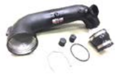
N54 Tial BOV Charge pipe