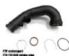
B48 intake pipe