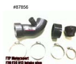
N13 intake pipe