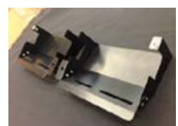
Dynamic Air Scoops