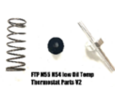
Low Oil Temp Thermostat Parts V2