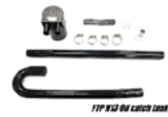
N13 oil catch tank kit