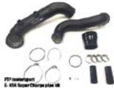
N54 Charge pipe Kit