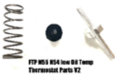
Low Oil Temp Thermostat Parts V2