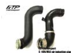
N55 air induction pipe