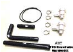
N54 Recirculation Valves blow off vavle kit