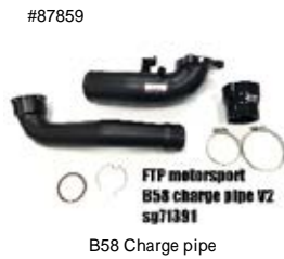
B58 Charge pipe