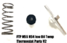
Low Oil Temp Thermostat Parts V2