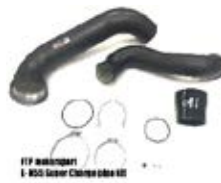
N55 Super Charge pipe kit