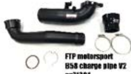
B58 Charge pipe