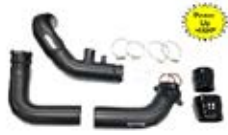
FTP B48 Charge pipe & Intake combo