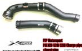
N20 Charge pipe + Boost pipe