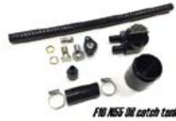
N55 oil catch tank