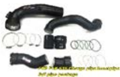
Charge pipe + boost pipe + air induction pipe