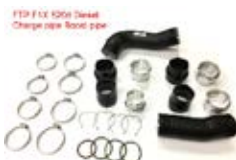
N47 Charge pipe + boost pipe