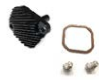
Thermostat cover kit