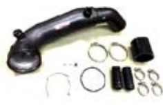
N54 charge pipe