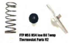
FTP N54 low Oil Temp Thermostat Parts V2