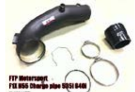
FTP Motorsport F1X N55 Charge pipe S951 640