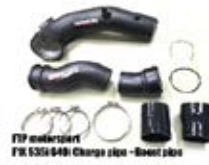
N55 Charge pipe + boost pipe