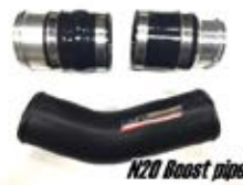
N20 Boost pipe