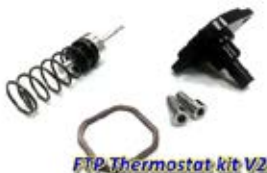
FTP Thermostat kit V2