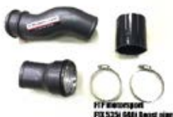
N55 Boost pipe