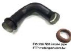
N55 intake pipe