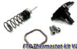
FTP Thermostat kit V2