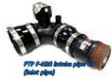
FTP F1X N20 Intake pipe V3 (Boost pipe)